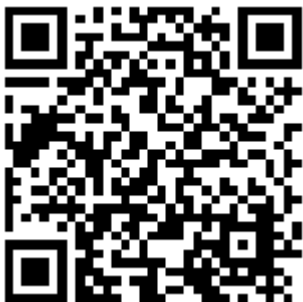
SCAN QR FOR PRODUCT PAGE

This part number has created a 3 metre duplex LC to SC OM2 LSZH patch cord in orange.